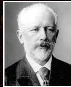
Tchaikovsky Marche Slav Opus 31